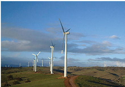
Figure 1: Challicum Hills Wind Farm, Victoria, Australia

The 52.5MW Challicum Hills Wind Farm, shown in Figure 1, was Australia's largest wind farm when completed in August 2003. Located on private farming land just east of Ararat in western Victoria, the wind farm generates enough clean electricity to supply 26,000 Victoria homes every year.