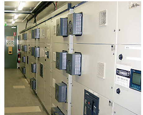
Figure 2: Elspec EQUALIZER-W Systems

Voltage control consists of two simultaneous operational modes: voltage regulation and voltage ride-through. The former is used to continuously adjust the wind farm voltage output, according to the measured voltage at 66kV, while the latter is used to support the wind farm network in case of short circuit or other significant voltage drop. A third voltage control function uses a safe voltage value that disconnects all capacitors in the system if a potentially unsafe 'high' voltage is measured.