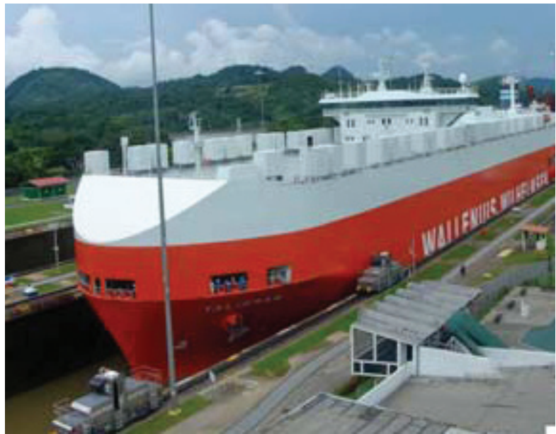
Views of the Locomotives in the Panama Canal

This document contains Elspec proprietary material. The information contained in this document is believed to be reliable and accurate.